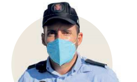
LOCAL POICE AGENT MIJAS Cycling Unit

"This service, highly demanded by users and businesses, is even more essential if possible this year due to the contingency plan put in place to fight COVID-19"